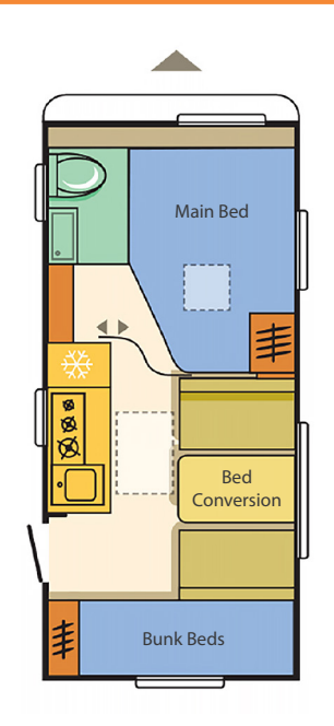
ADRIA 472 PK